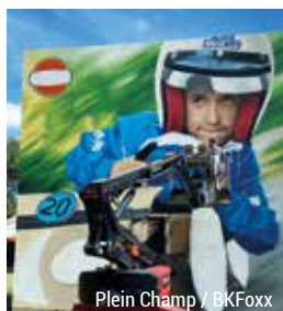
Plein Champ / BKFoxx