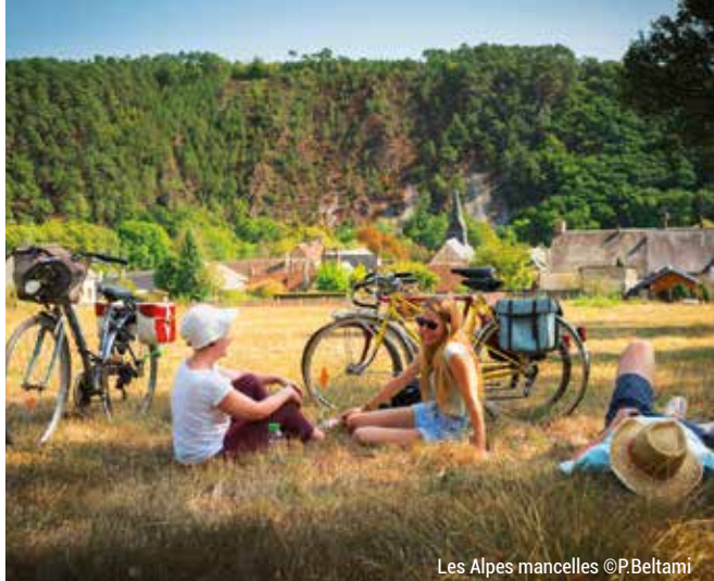
Les Alpes mancelles

www.sarthetourisme.com/incontournables/les-alpes-mancelles