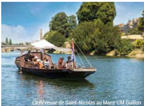
La Rêveuse de Saint-Nicolas au Mans