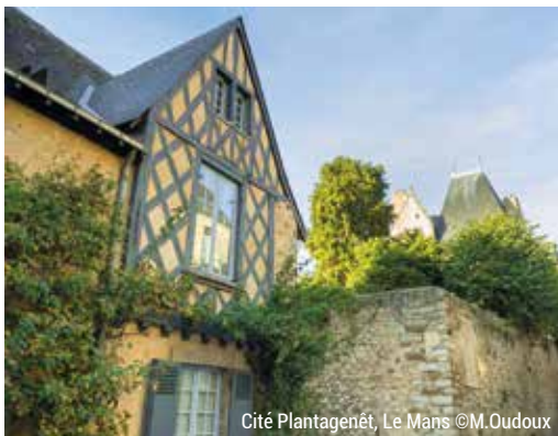
Cité Plantagenêt, Le Mans