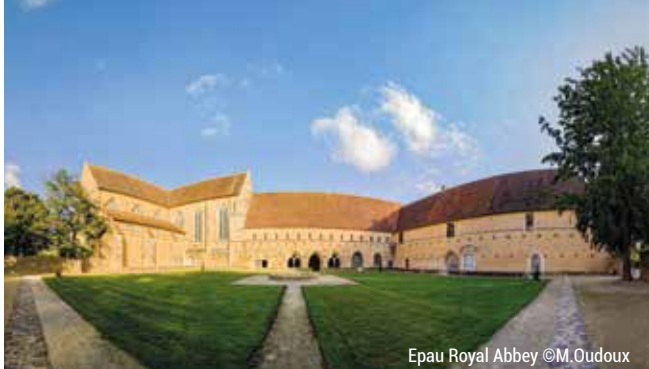
Epau Royal Abbey