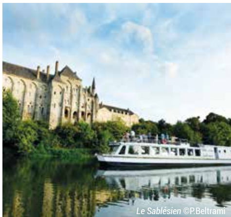
Le Sablésien

Enjoy a trip on board the Le Sablésien cruise boat. Embark at Sablé-sur-Sarthe and savour a lovely meal or aperitifs as you discover the manor houses hidden away in the gorgeous green surroundings.