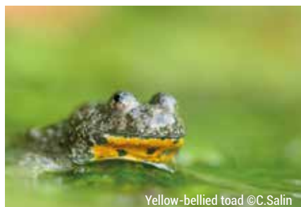
Yellow-bellied toad