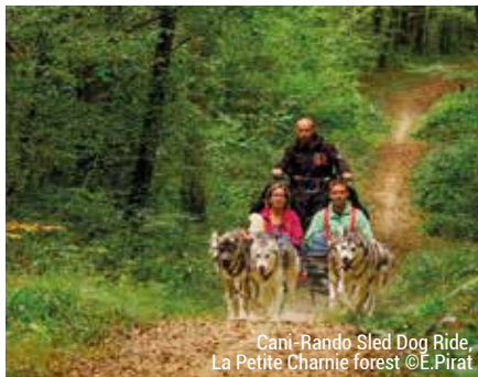
Canic-Rando Sled Dog Ride, La Petite Charnie forest

Sled-dog hiking is walking with a dog in front of you, attached to a waist belt. It is more than just an outing, but a real opportunity to develop a bond with the animal. Meanwhile, sled-dog rides use a kind of sled on wheels, pulled by a dozen or so dogs. As if you were out with a team in the Far North, you'll hurtle through the forest at high speed and enjoy an unforgettable thrill! Dog sledding is accessible to people with reduced mobility.