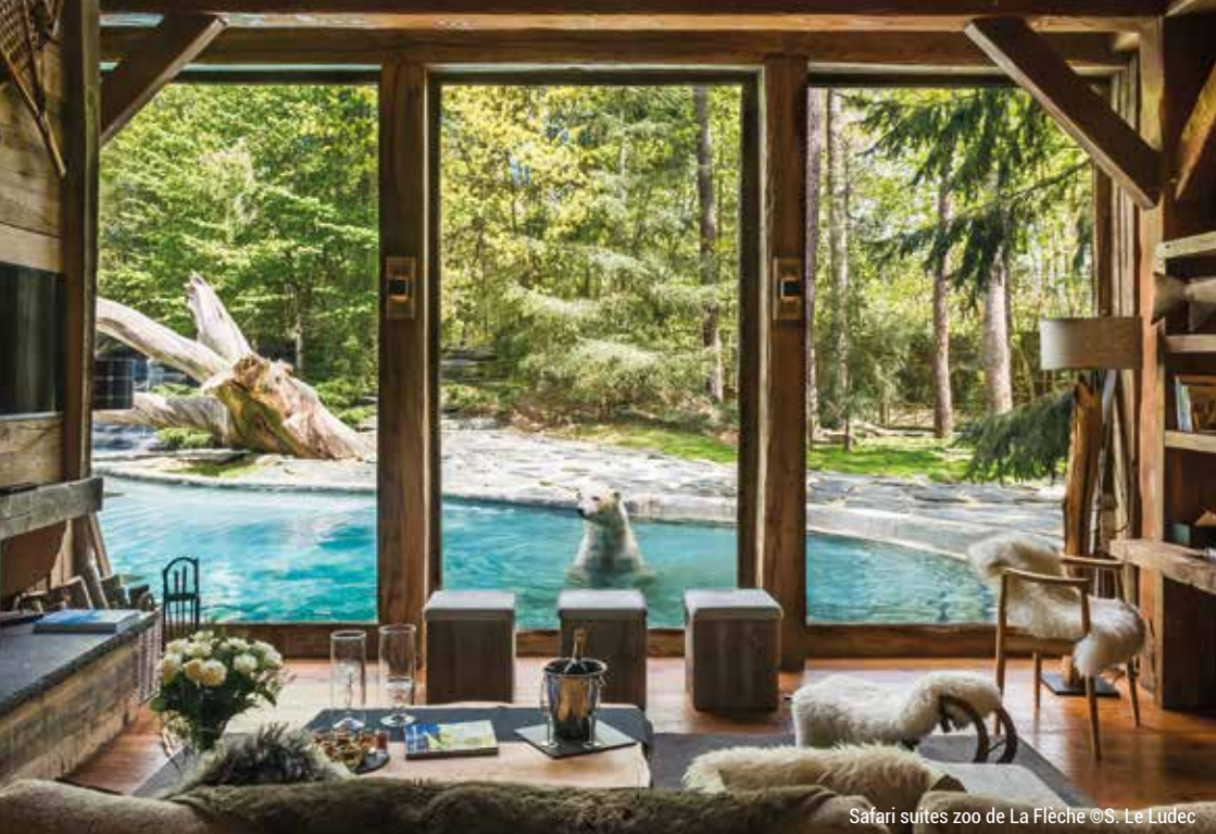
Safari suites zoo de La Flèche

Keen for something new? Here are a few ideas for a quirky kind of stay not too far from home!