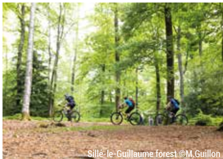
Sillé-le-Guillaume forest

www.sarthetourisme.com/la-ronde-des-vallees-et-forets-2