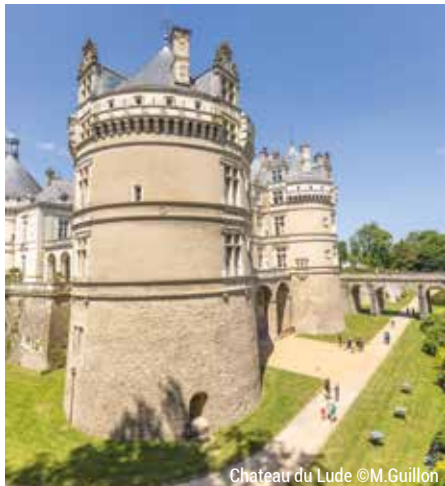
Chateau du Lude

www.sarthetourisme.com/la-vallee-du-loir-a-velo