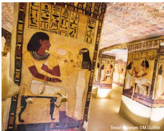
Tessé museum

www.sarhetourisme.com/decouvrir/patrimoine-culturel/les-musees-de-la-sarthe/