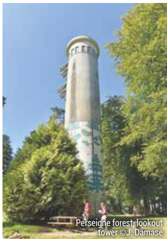
Perseigne forest, lookout tower