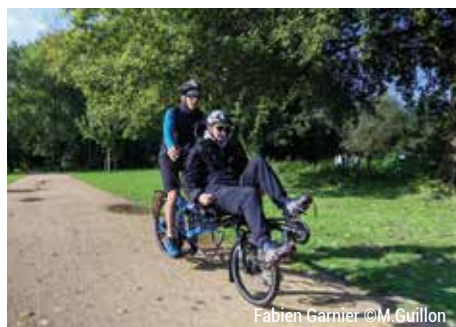
Fabien Garnier ©M.Guillon