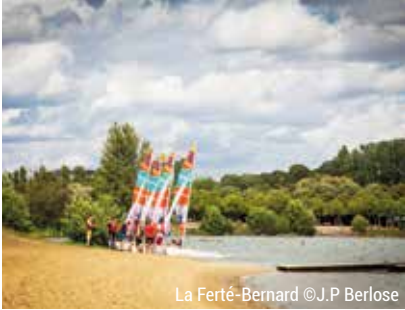
La Ferté-Bernard

Do you feel like a day of fun with the family? The beaches at the leisure centres and swimming pools offer something for everyone with watersports, a chance to bask in the sun, fishing, or even cycling nearby!