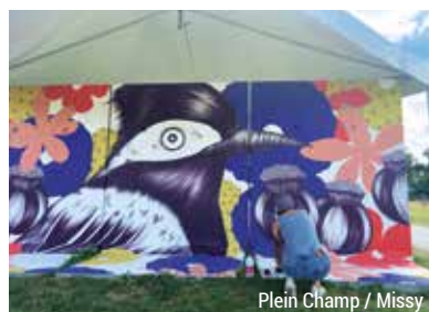
Plein Champ / Missy