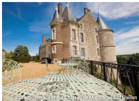
Panoramic terrace at the Château de Montmirail