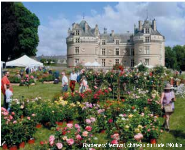
Gardeners' festival, château du Lude