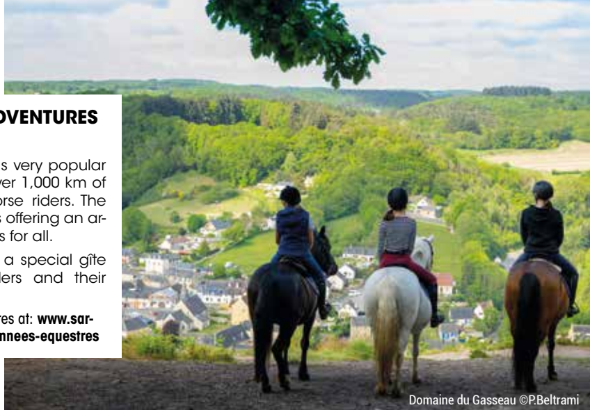
Domaine du Gasseau

See the equestrian centres at: www.sarthe-tourisme.com/randonnees-equestres