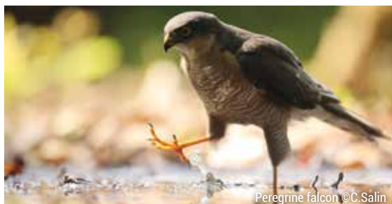
Peregrine falcon