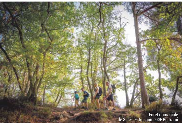
Forêt domaniale de Sillé-le-Guillaume

Discover the countryside of La Sarthe at your natural pace. You'll love the variety of hiking trails (hedgerows and meadows, forests, hollow ways, wetlands and craggy slopes) and the varied rural heritage of the picturesque villages.