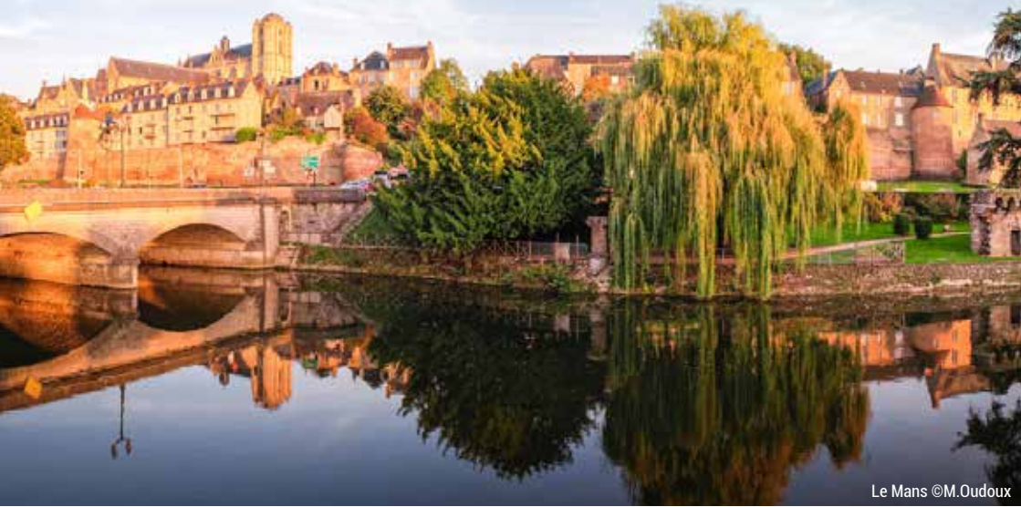
Le Mans

Having been at the centre of influence in medieval times and an innovative hub during the 19th and 20th centuries, La Sarthe boasts a very rich heritage, accessible to all. Over the past few years, several cultural sectors have emerged and further boosted the region's appeal.