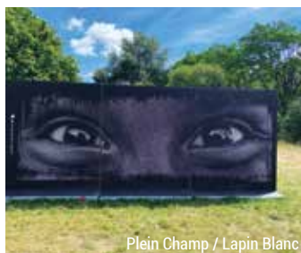
Plein Champ / Lapin Blanc