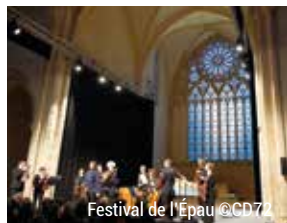
Festival de l'Épau